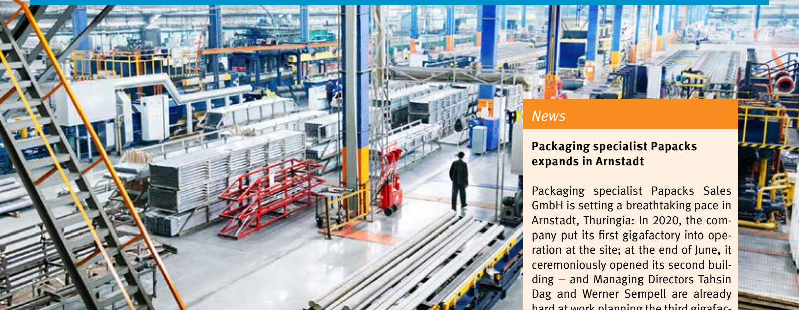
The Thuringian battery cluster continues to grow with LION Smart Production GmbH.