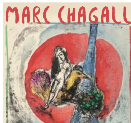
Advertising poster for the upcoming Chagall exhibition.

600,000 visitors. The association's projects have been dedicated to artists such as Francisco de Goya, Pablo Picasso, Joan Miró and Andy Warhol. The current Chagall show features exhibits borrowed from the Museum Pablo Picasso in Münster – including a large number of unique pieces as well as rare condition and proof prints by the monumental artist. (hw) www.kunsthausepolda.de