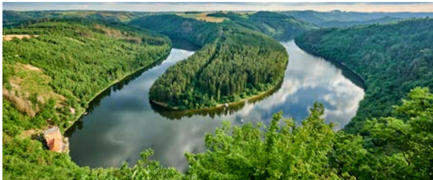
The impressive meander of the Saale river in southeastern Thuringia.

Looking down on Europe's largest contiguous reservoir from above the Saale River, it's easy to imagine yourself in Norway: Like a Scandinavian fjord landscape, the wide expanses of water framed by deep forests in southeastern Thuringia will warm the heart of every nature lover. The castles of Dornburg amidst vineyards are also picturesque;