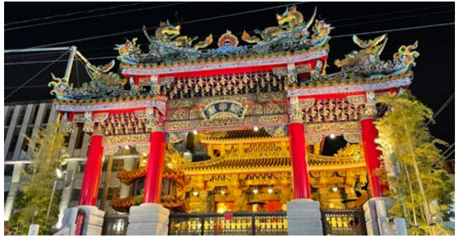
Impressive city images in Japan, taken on the occasion of the visit to the OPIE – Optics & Photonics Intern. Exhibition in Yokohama.

The Thuringia International team has been incredibly busy in 2023 – it has carried out projects such as delegation and company trips and organized network meetings and trade fair visits for countries on five continents, making lots of new contacts in the process.