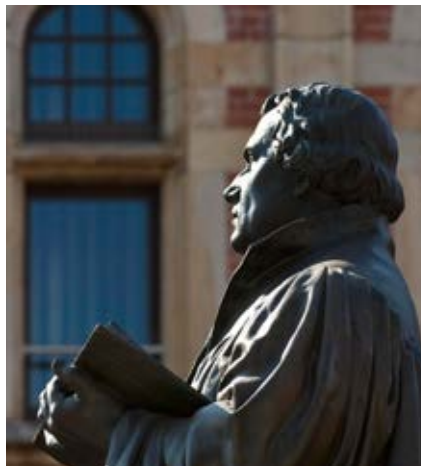
Left many traces in Thuringia: The reformer Martin Luther.

For information on events featuring these two artists and other Luther-related events in the theme year, visit weltkultur.thueringen-entdecken.de . (hw)