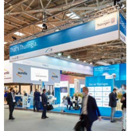
The Thuringian joint booth at the real estate fair EXPO REAL in Munich.

ment in Munich, the Fakuma trade fair for plastics processing in Friedrichshafen and the Frankfurt Book Fair. LEG already has attractive trade fairs booked for spring 2022, including Hannover Messe and Laser World of Photonics in Shanghai. (hw)