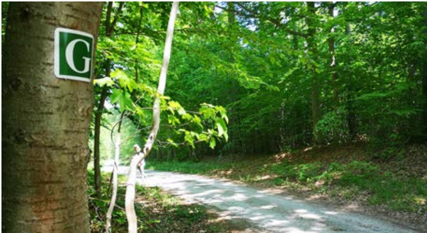
Numerous hiking trails related to Goethe can be discovered in Thuringia.

Goethe quote, and are intended to transport visitors back the Weimar Classical Period. About 29 kilometers (walking time approx. 8 hours) is the total length of the Goethe Experience Trail through the charming landscape of the Weimarer Land. As part of the Thuringia 2025 tourist trail concept, the trail has been clearly signposted. The Free State is supporting the construction and marketing of the trail with a total of 474,000 euros. The route is intended to attract both nature and city tourists all year round. (hw/maa)