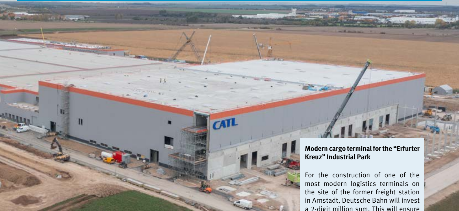
There is space for up to six production lines in the approximately 500-meter-long building of CATL's battery gigafactory.