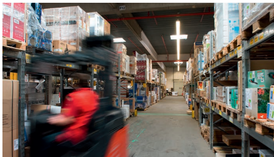
Thuringia is a prime logistics location: An increasing number of companies appreciates the region's attractiveness for logistics services.