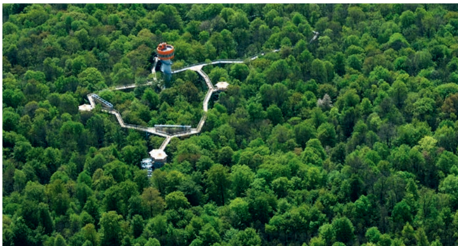
The beech forests of the Hainich National Park are listed as a UNESCO World Natural Heritage Site since June.