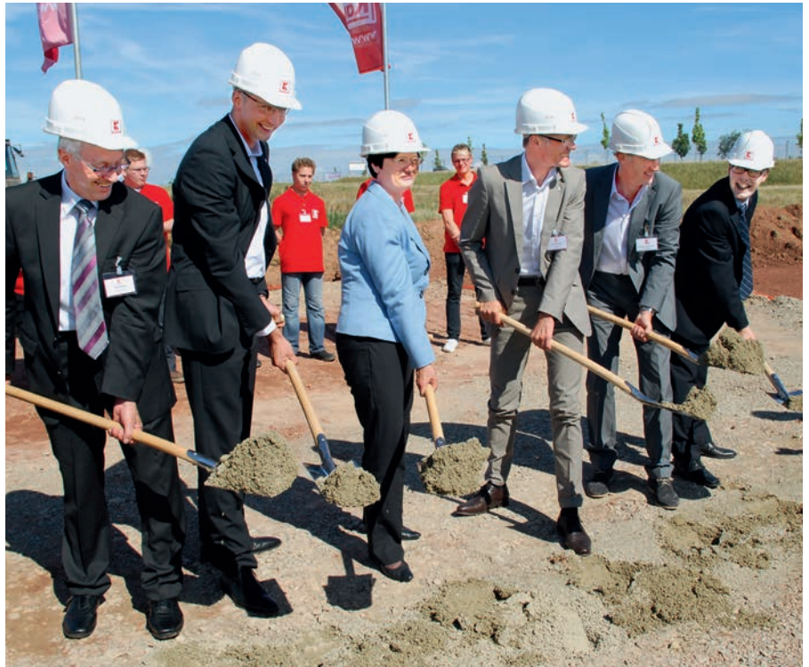
A sought-after address not only with Kaufland Group: Thuringia takes the top spot in the state rankings of “Site Selection”, thus positioning itself as one of the prime investment locations in Europe.

“We will even exceed this sum. Our total investment is around EUR 90 million.”