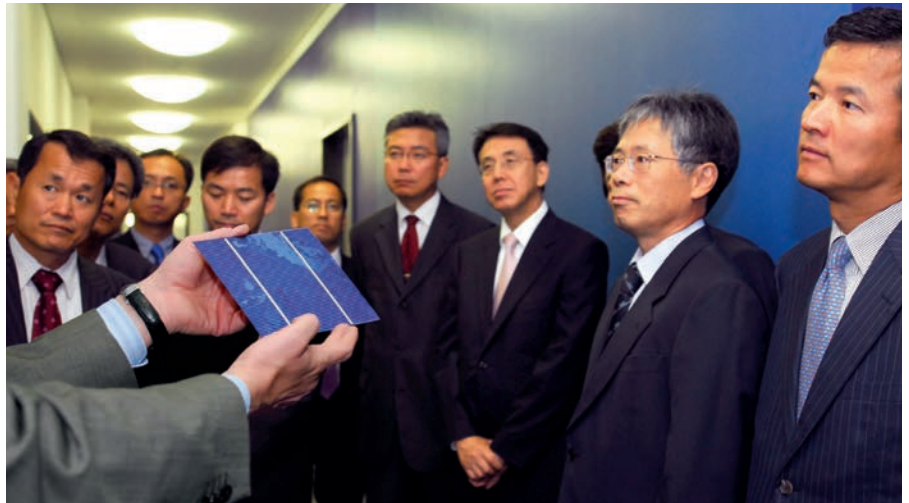
LEG Thüringen maintains close relations all over the world. Already in 2008, a Korean delegation visited solar companies in Arnstadt. Now, entrepreneurs from Thuringia will travel to Korea.