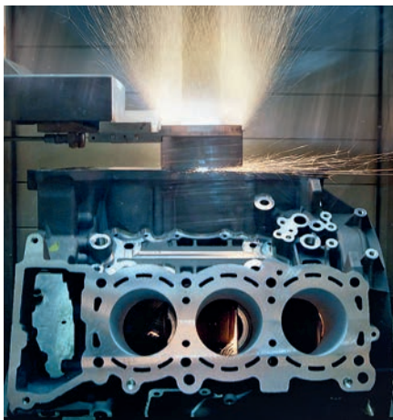
Clean cars: Daimler expands its production of fuel-efficient engines at the "Erfurter Kreuz" industrial estate.

The carmaker plans to invest EUR 90 million in building its new production facility, where engine components for passenger vehicles are expected to start rolling off the production line as early as next year. By locating at the Erfurter Kreuz industrial estate, the newcomer, which does business as MDC Technology GmbH, will be in perfect company. Since 2006, a number of other large corporations – including Bosch,