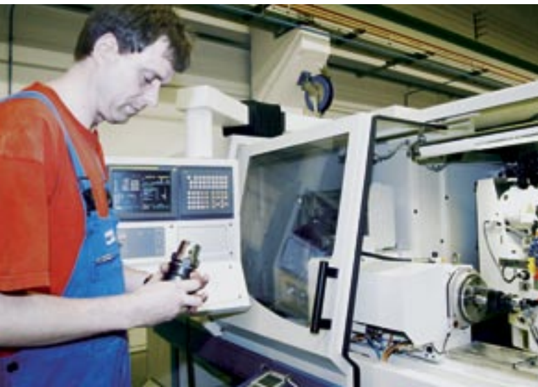
Tools from Sandvik Coromant GmbH (Schmalkalden) are very popular with the major automotive manufacturers.

Müller Weingarten AG operates the worldwide third-largest press manufacturing operation in Thüringen.