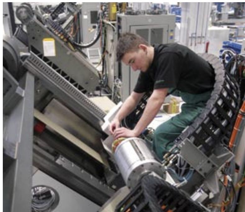
Deckel Maho in Seebach, a subsidiary of the Gildemeister group, is one of the most innovative companies in mechanical engineering.

An economic climate that is creative and open to innovation, a committed and flexible workforce and an excellent infrastructure: Thüringen offers engineering firms optimal conditions for investment and employment. This branch of industry is already the third largest employer in the region. Over 200 companies employ more than 15 000 people. The proportion of exports rose to 27.1 % in 2005; turnover was euro 1.8 billion. And the trend is upwards.