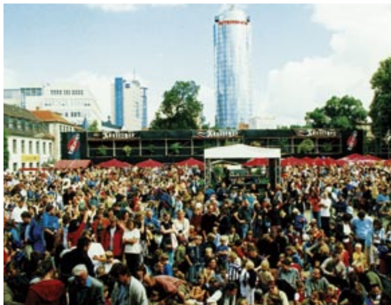
Attracts thousands of guests to Jena: the 'Kulturarena'.

In your search for a suitable location in Thüringen, you can draw on three up-to-the-minute databases operated by LEG. The online Site Information Service furnishes data on all industrial and commercial locations in Thüringen. For information just enter your site requirements. The database will then tell you all you need to know about the size of the pace available, the development status, rail (links, etc.). Through the Industries Information Service, you will be able, for example, to find a selection of companies that exist at a given location on a sector-by-sector basis, 'The Investors' Information Service provides details about businesses recently established at a particular site. This service will be made available to you by LEG staff. Once you have made your choice, LEG officials will be glad to accompany you to the location concerned.