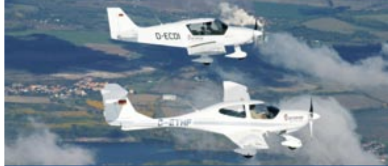
Aircraft engine manufacturer Thielert sets up operations in Altenburg.