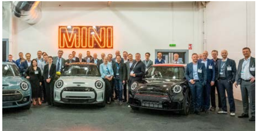
A visit to the British production facility of the MINI at BMW Oxford was also on the agenda of the Economics Minister's trip to Great Britain.

After a successful first half-year with numerous trade events and trips to countries such as the UK and Romania, our Thuringia International team is looking ahead to a packed schedule in the second half of the year. Various delegation trips, events and trade fairs will give companies guidance and momentum for their international businesses.