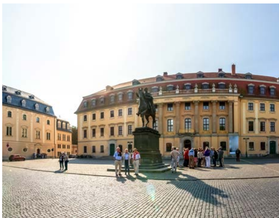
University of Music FRANZ LISZT Weimar.

It still serves its mission of training professional musicians at the highest international level. It not only educates but also organizes a wide variety of events – including more than 300 concerts and performances a year, the Weimar Master Classes with their 60-year tradition and four international competitions for piano, violin and chamber music. "With its wide-ranging events, the University of Music Franz Liszt is an important part of the arts and culture scene in Thuringia," said Minister President Bodo Ramelow at the anniversary celebration in Weimar at the end of June. (hw)