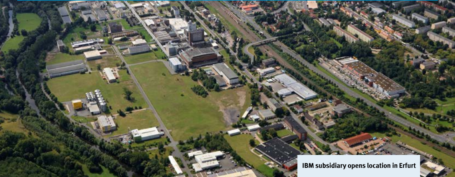
In the Rudolstadt-Schwarza industrial site, the Korean company SungEel HiTech and its partner Samsung C&T Deutschland GmbH will in future strengthen the Thuringian battery cluster with a state-of-the-art recycling plant.